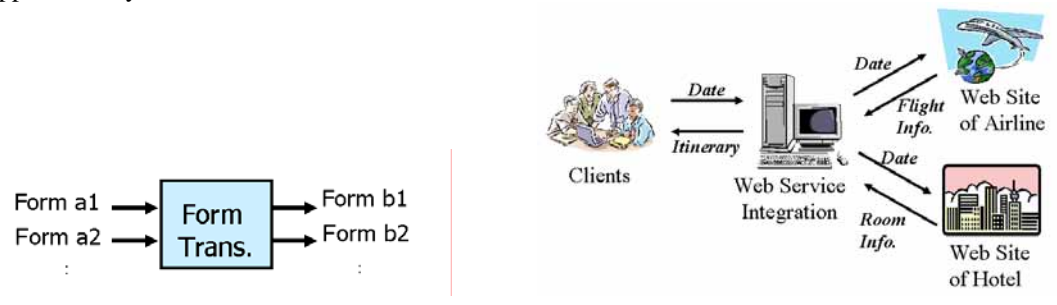
Figure 3. Form transformation for Web service integration. Figure 4. An example of Web service integration.

Then the Web service integration of some individual Web services is considered as transformation from some input forms into some output forms as shown in Figure 3. Our goal is that domain experts make an application by the form transformation.